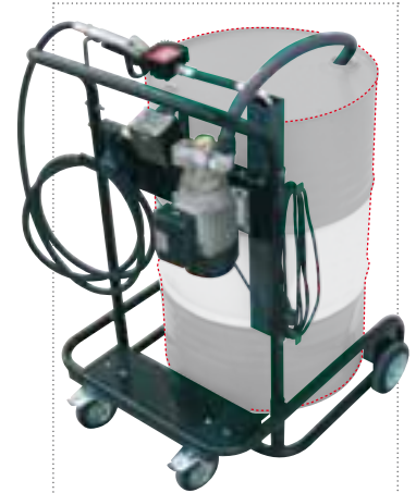
Integrated battery charger