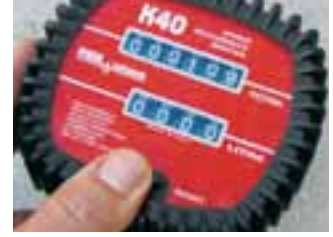
Mechanical counter with total-partial resetting.

Meter body in die-cast aluminium to withstand high pressure. Input/output 1/2" GAS (NPT) Nozzle with: trigger protection to avoid accidental operations. Input with rotating 1/2" Gas (NPT) attachment and incorporated filter. Rigid or flexible end with automatic drip proof valve.