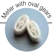
Meter with oval gears