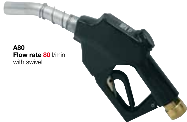
A80 Flow rate 80 l/min with swivel