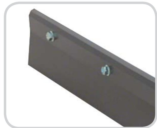
The blade’s 20° leading edge lifts and “spirals” debris and water off the belt quickly and efficiently.

A specially-shaped blade is the key to the V-Plow’s cleaning power. The blade’s 20° leading edge lifts and “spirals” debris and water off the inside belt quickly and efficiently. Conventional flat-bladed plows cause the carryback materials to roll and repeatedly try to push under the blade. And the V-Plow Blade is self-adjusting. The blade floats on the belt and maintains blade-to-belt contact as the blade wears.